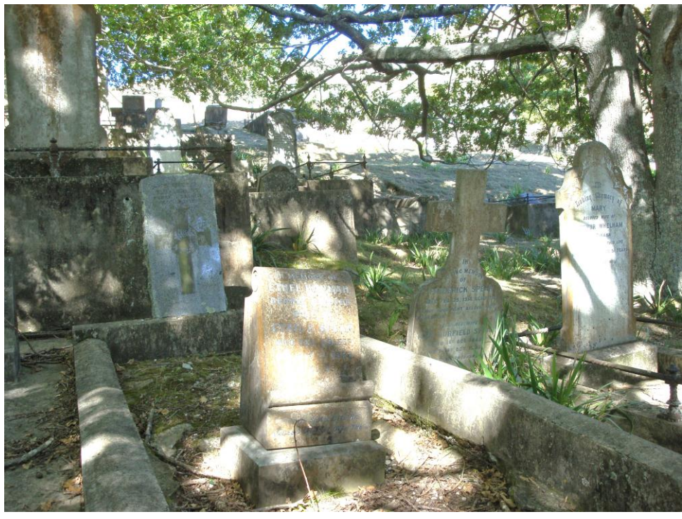
SPEAR Ethel nee BARNES, Wakapuaka Cemetery, Nelson C/E Block 13, plot 17.