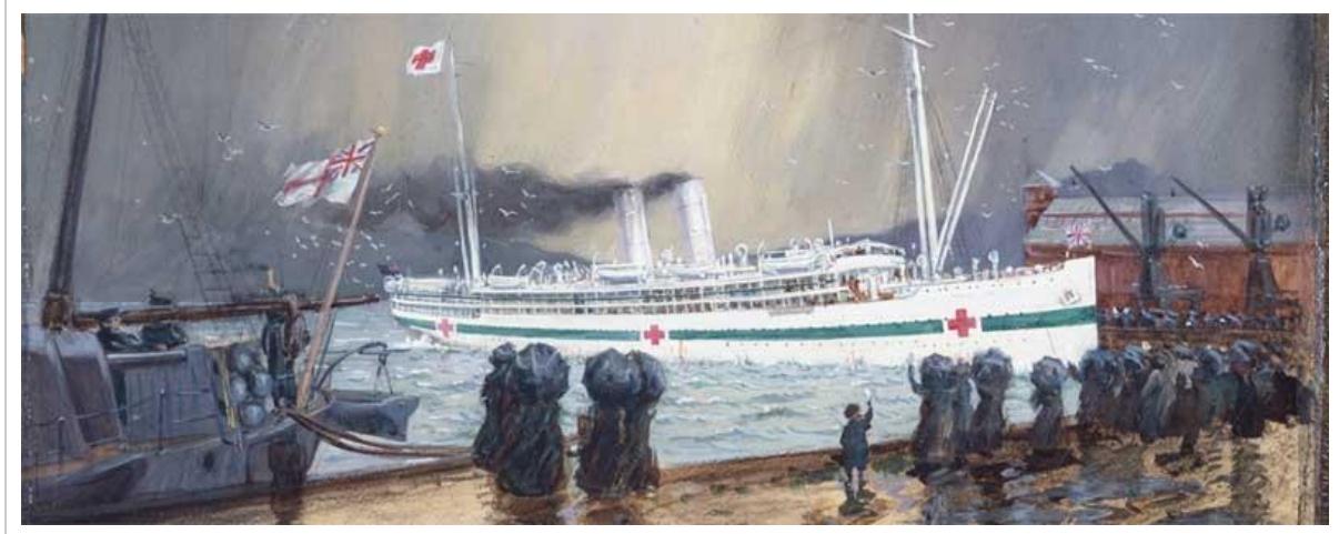
Departure of the Hospital Ship "Maheno", 1915

The Maheno had eight wards and two operating theatres, an anaesthetising, a sterilising, and an X-ray room, a laboratory, a laundry and drying-room, steam disinfector, dispensary, telephone exchange, and two electric lifts each of which took two stretchers at a time. On July 11th 1915, H.M.N.Z. hospital ship Maheno sailed from Wellington, with the hospital section staffed by a matron and thirteen nursing sisters, five medical officers, a detachment of sixty-one orderlies of the New Zealand Medical Corps, and chaplains. Capacity 340 cot cases.